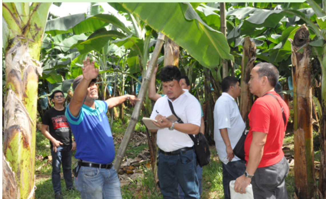
Strategic compliance activity in the agriculture sector in the Philippines @ ILO

In Colombia , training of workers on labour inspection tools made them active actors in addressing the use of ambiguous and disguised employment relationships, resulting in the formalization of selected sectors of the economy, such as the palm oil, port and mining sectors. In the Philippines , training of trainer programmes capacitated both workers' and employers' organizations to facilitate their active participation in labour inspection visits and to promote compliance with labour law at the workplace level. In Tanzania , the labour inspectorate is directly engaging with trade unions at workplace, district and regional levels in order to support labour inspection visits.