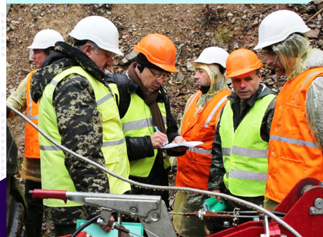
Training of labour inspectors in the forestry industry in Ukraine

In various countries, through projects support, efforts have led to increased collaboration between these institutions. In Georgia , training programmes were organized by the High School of Justice for judges on International Labour Standards (ILS), resulting in an increasing number of judgements referring to ILS. In Serbia , mutual learning workshops have led to the development technical notes for judges with recommendations on how to improve the effectiveness of the labour administration and the judiciary to deter undeclared work. In Colombia , specific tools were developed that helped judges to review administrative appeals of sanctions imposed by labour inspectors for cases of ambiguous and disguised employment relationships. The Consejo de Estado, used the legal interpretation in these tools when it upheld the first ever sanction ($1.1 million USD) imposed under the law. In Ethiopia , the labour inspectorate held a series of meetings with judges to jointly develop guidance materials and a toolkit to expedite the submission of cases for prosecution of noncompliance under national labour law.