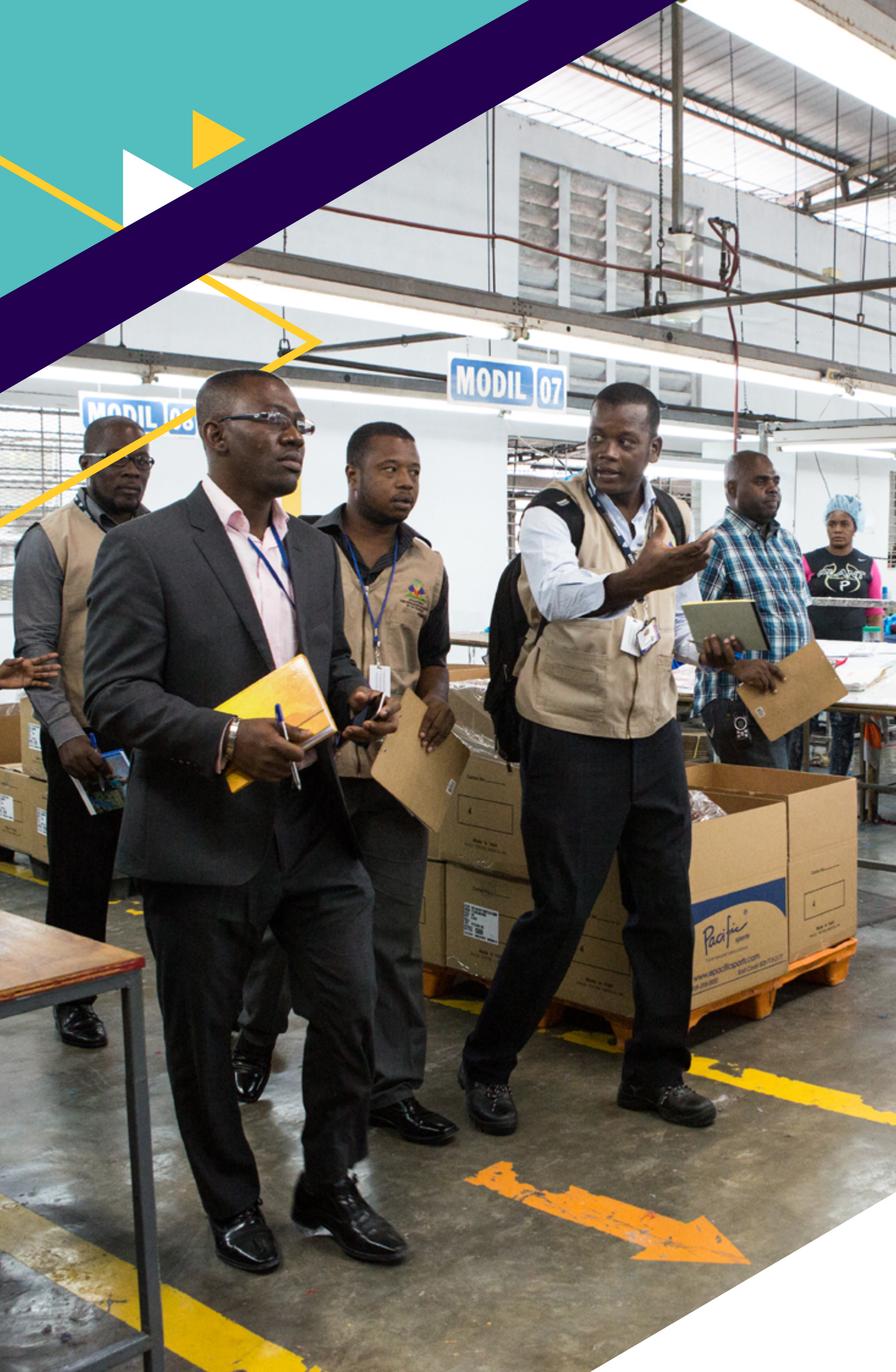
Labour inspection visit in Haitian garment factory