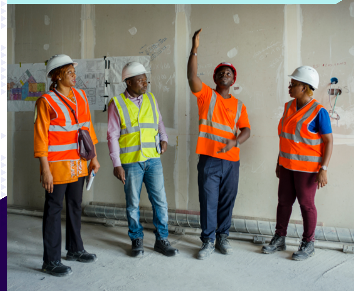
Labour inspection visits in Madagascar

In 2021, nine countries (Botswana, Colombia, Eswatini, Indonesia, Ivory Coast, Madagascar, the occupied Palestinian territory, Tanzania, and Zambia) were actively engaged in the implementation of strategic compliance plans across various economic sectors. In these nine countries, labour law compliance increased by 39% in the targeted sectors, improving working conditions of an estimated 108,090 workers. Another eleven countries were working on the preparation of strategic inspection plans and six new countries requested Office support in this area.