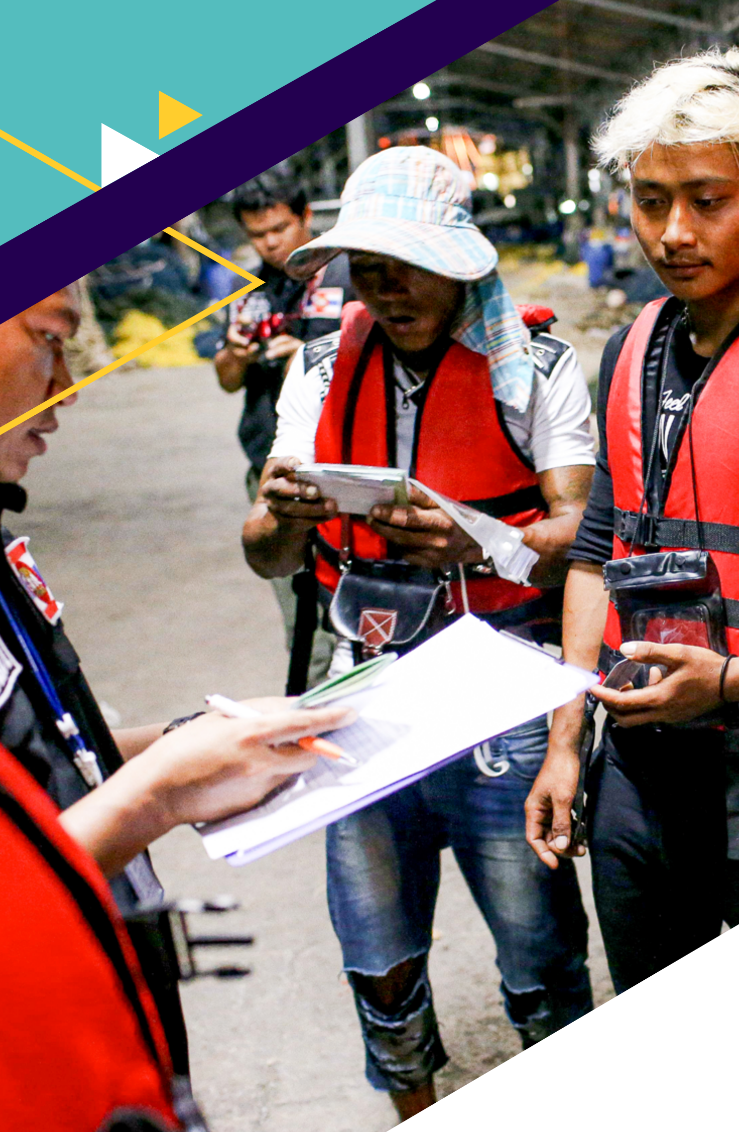
The boats inspectors along with ILO representatives on boat inspection at Phuket Fishing pier

Member States are therefore encouraged to ratify them because of their importance to the functioning of the international labour standards system. The ILO Declaration on Social Justice for a Fair Globalization , in its Follow-up, emphasizes the significance of these Conventions from the viewpoint of governance.